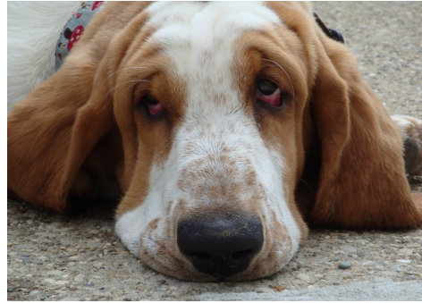
Flash- 2010 Calendar Cover

For additional entry forms visit www.Friendsoftheshelterky.org or call (859) 525-0329